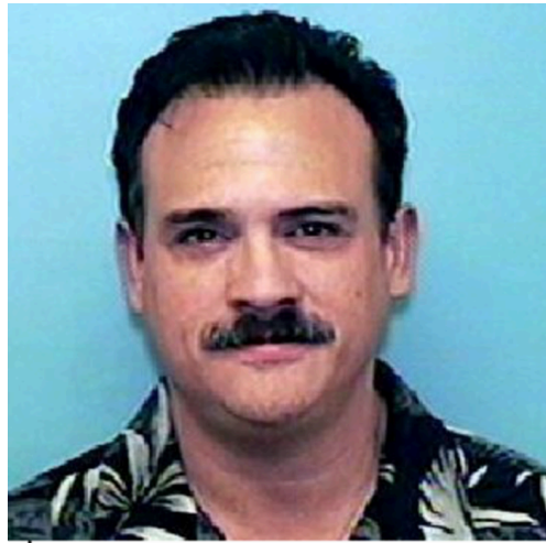
Photograph taken in 2009