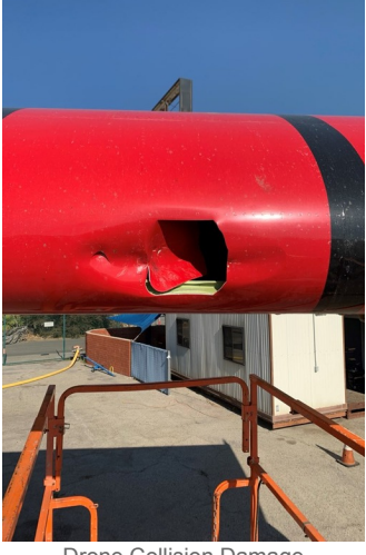
Drone Collision Damage