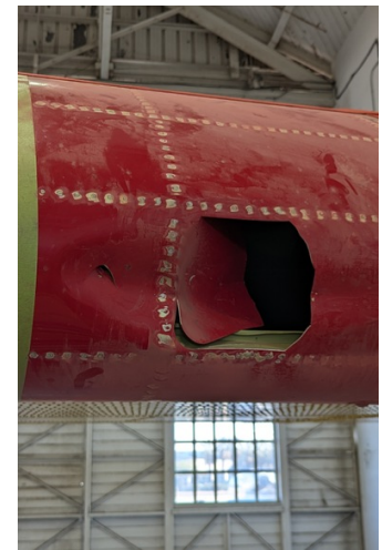
Drone Collision Damage