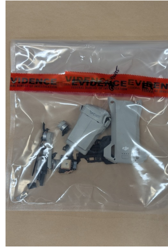
Recovered Drone Parts