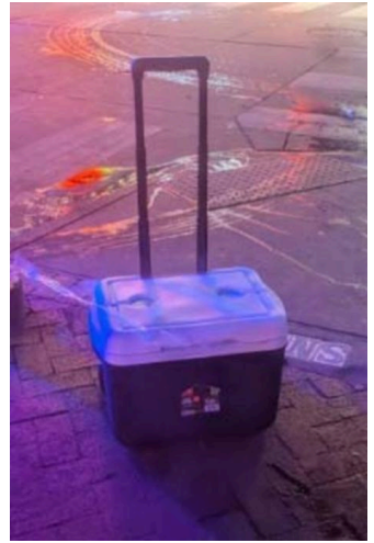
Cooler with IED placed near Bourbon and Orleans Streets