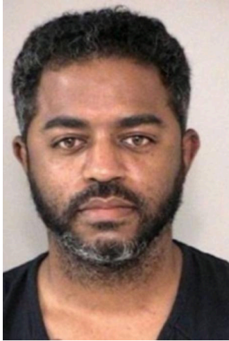
Photograph taken July 11, 2020