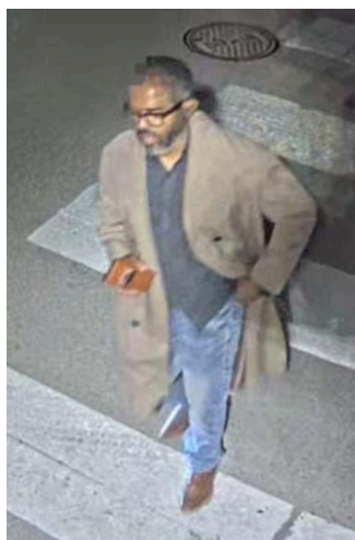
January 1, 2025, 2:03 a.m. CST