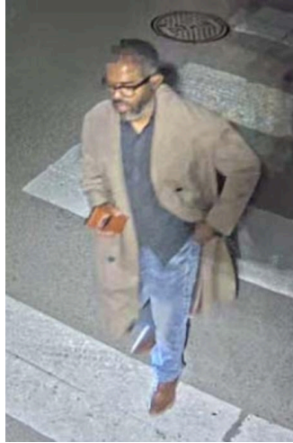
January 1, 2025, 2:03 a.m. CST