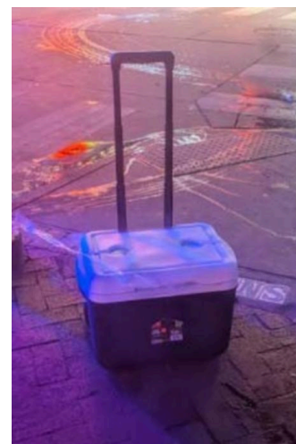
Cooler with IED placed near Bourbon and Orleans Streets