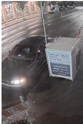
Ballot Box and Suspect Car - Portland, Oregon

Vancouver, Washington Portland, Oregon October 2024