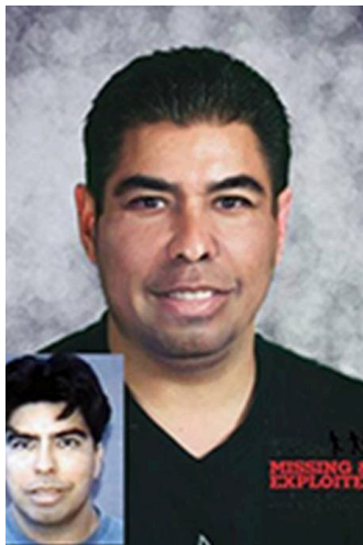
Photograph age progressed to 46 years of age