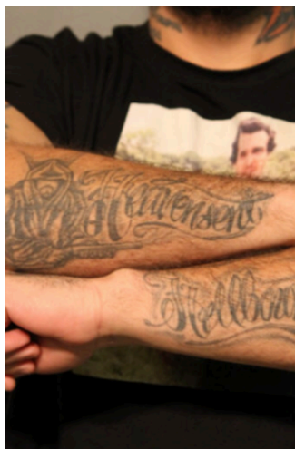
Matos Forearm Tattoos