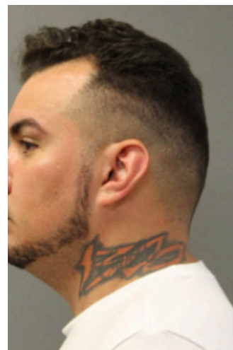
Matos "1300" Neck Tattoo